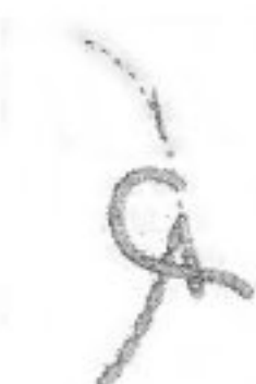
Stem or Straight Stitch